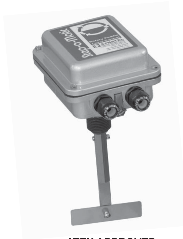
ATEX APPROVED STEP-A-MATIC SML1A Rotary Paddle Probe